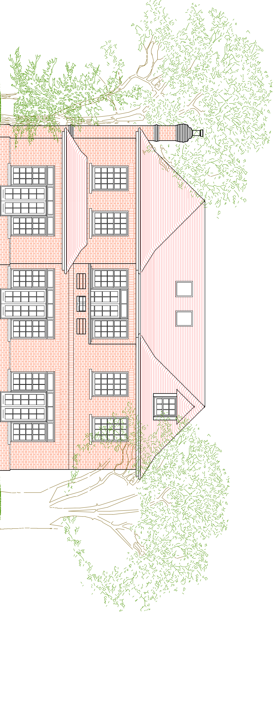
rear elevation facing north-east scale:1:100